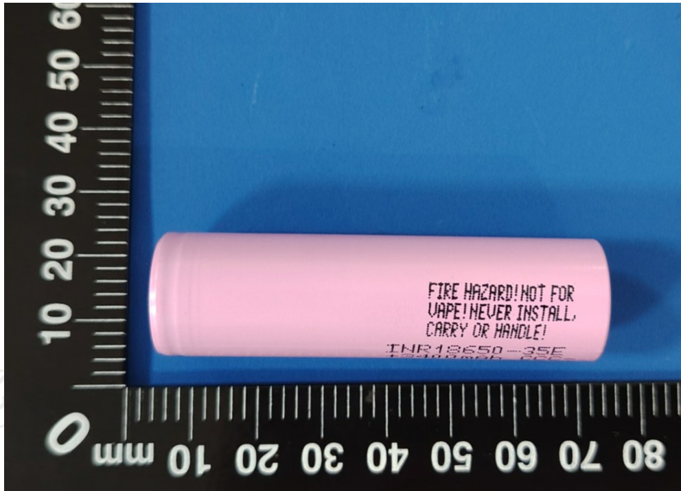
Picture 3. Front view of cell 图片 3. 电芯前视图