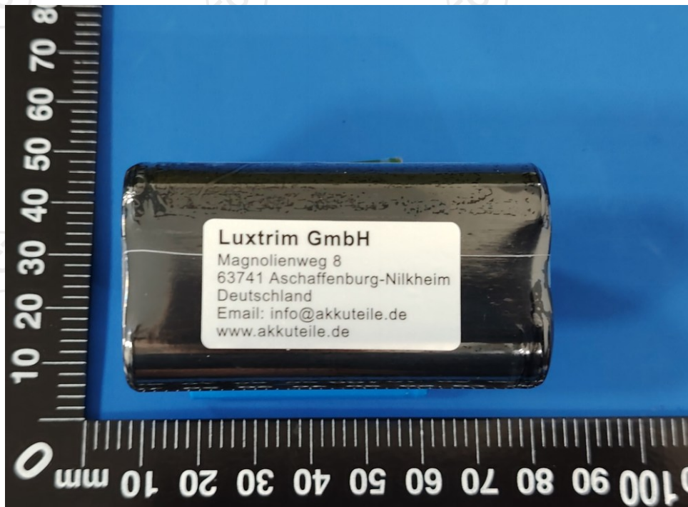
Picture 2. Back view of battery