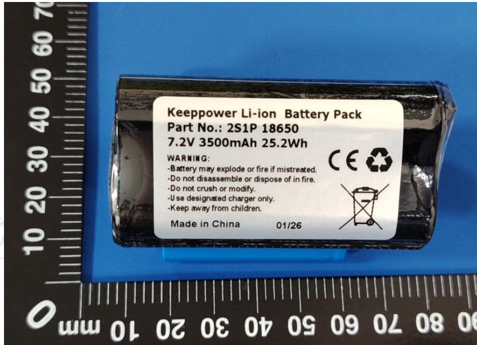
Picture 1. Front view of battery