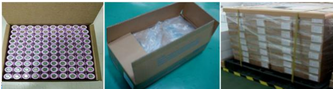
Small box 小箱