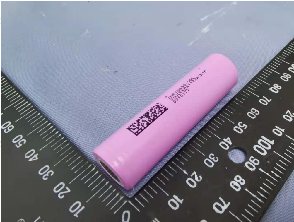
Figure 3 Overall view of cell (电芯图)