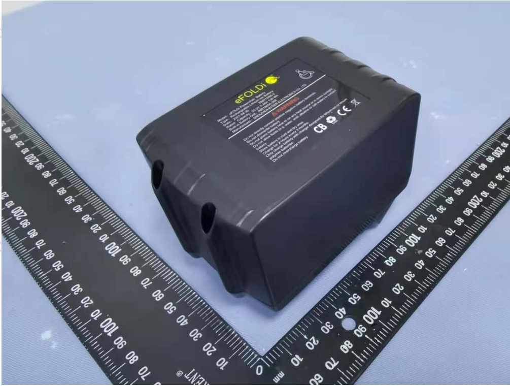
Figure 1 Overall view I of battery (外观图I)