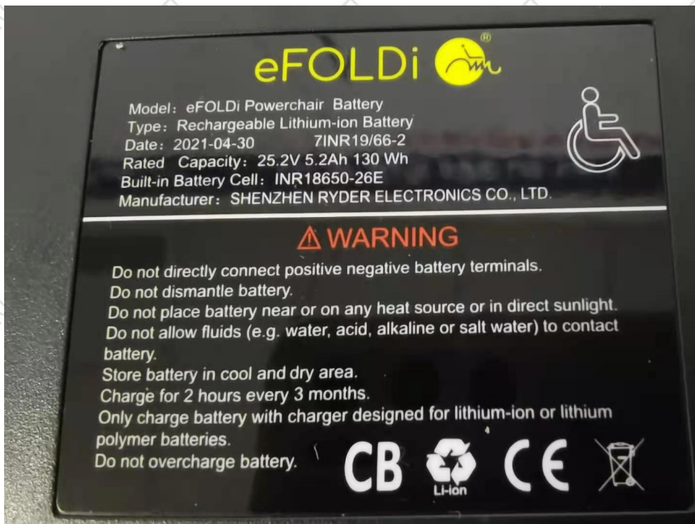
Figure 4 Battery label (电池标签)