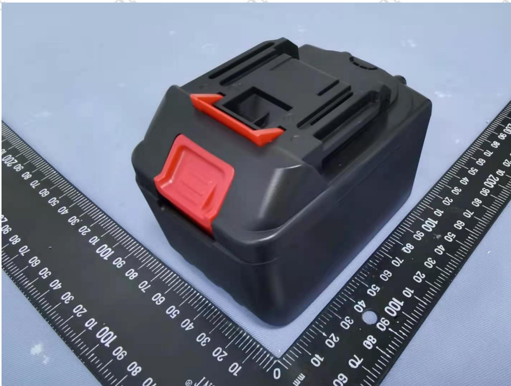
Figure 2 Overall view II of battery (外观图II)