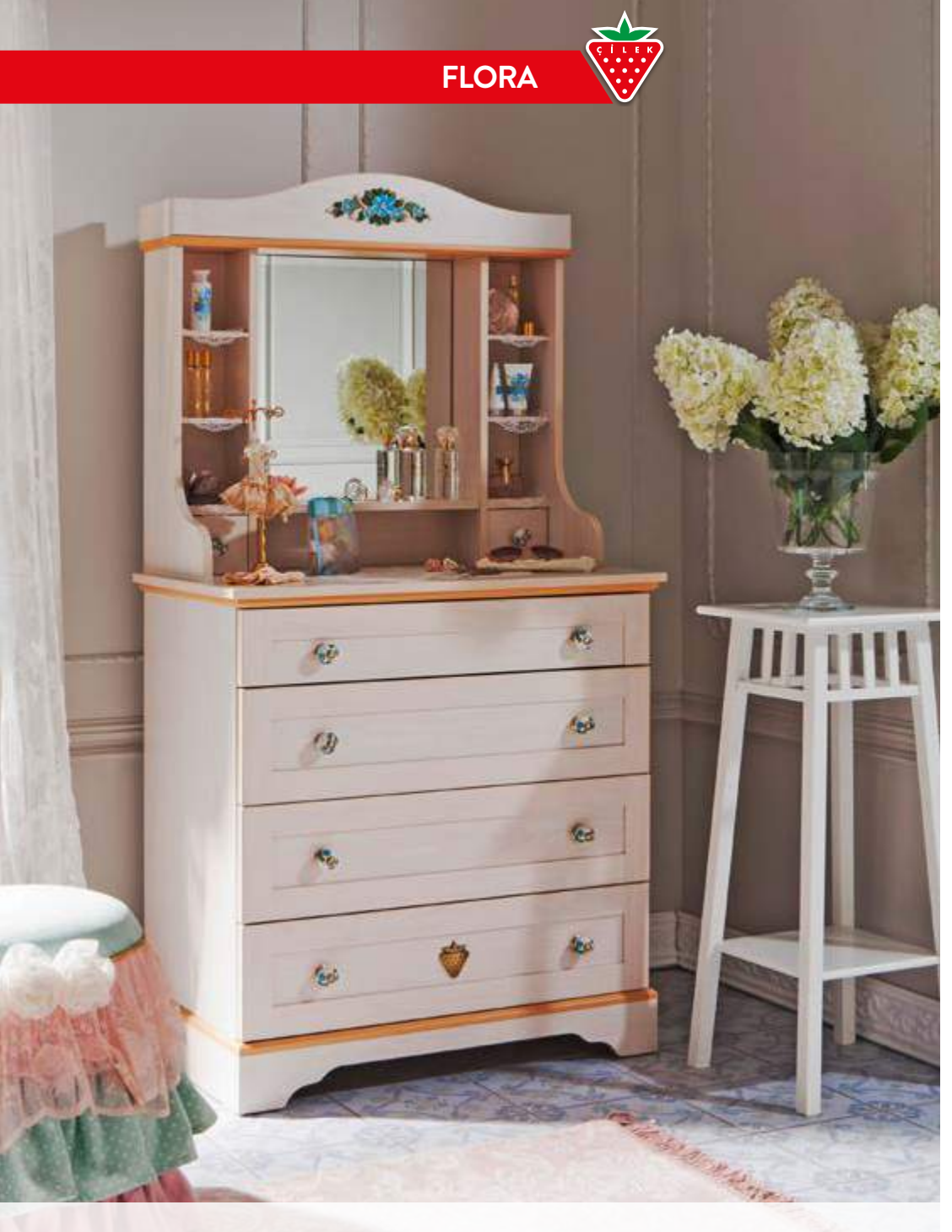
Our large-volume drawer with a storage capacity of 30 kg closes softly each closes softly and silently by the braking system in its drawers, safe against possible jams.