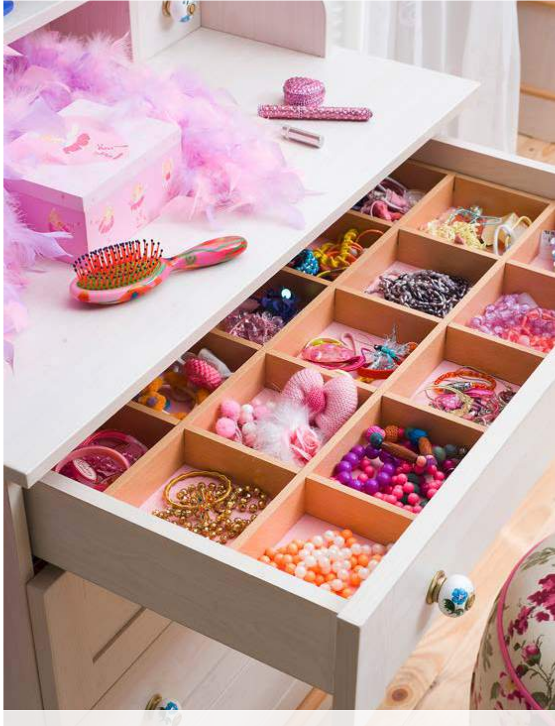
Cloth-coated drawer divided into several compartments for the personal belongings of young girls.