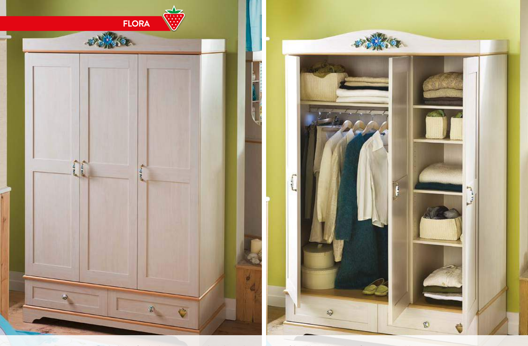
By the help of its braking system on the cabinet doors, closes softly and quietly and is safe against possible jams. Its 2 drawers and several inner shelves provide ease of use.