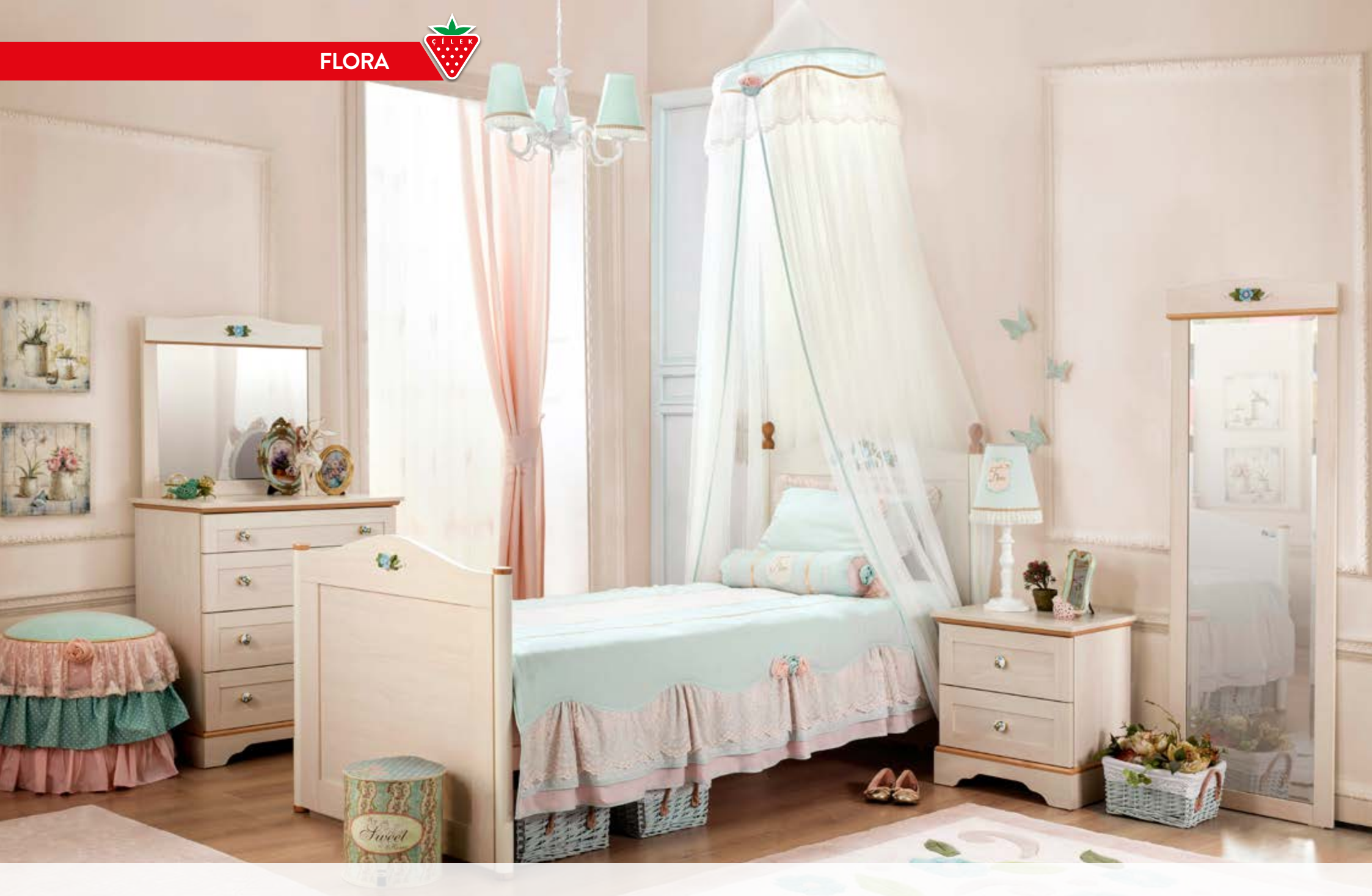
Natural birch coating and fine craftsmanship details on beech, spring air in your room with hand-painted flowers, porcelain decorated with flowers and brass-covered handles.