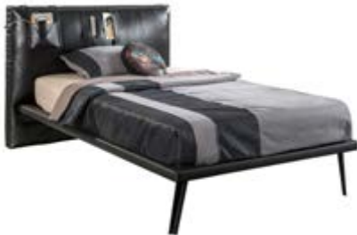
XL BED (120x200 cm)

W: 40 x H: 187 x D: 48cm 1 Packet • 18 kg • 0,057 m 3 20.52.1105.00