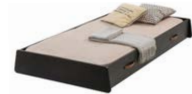
PULL-OUT BED (90x190 cm)

W: 115 x H: 105 x D: 220cm 3 Packets • 80 kg • 0,652 m 3 20.52.1301.00