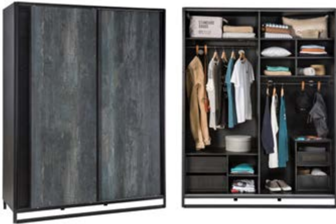
LARGE SLIDING WARDROBE

W: 162 x H: 210 x D: 58 cm 6 Packets • 170 kg • 0,433 m 3 20.52.1003.00