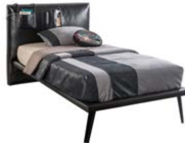
L BED (100x200 cm)

W: 135 x H: 105 x D: 220cm 3 Packets • 89 kg • 0,733 m 3 20.52.1302.00